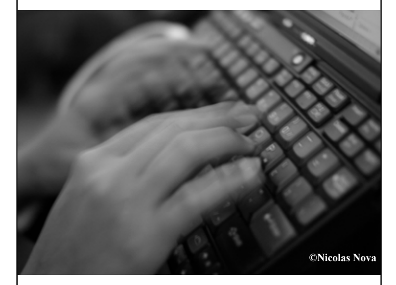
Join us for the Friday Morning Writing Club at the Faculty Center from 10 a.m. to noon.