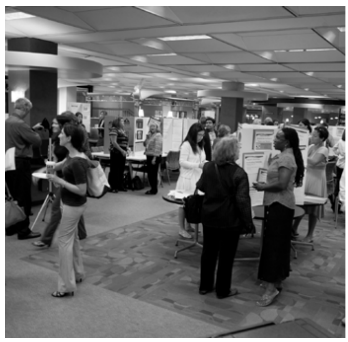
Pictured above : Faculty participate in the Poster Showcase session in the Library Knowledge Commons at the 2011 Summer Faculty Conference, held in May. The conference offered roughly 90 different sessions primarily led by UCF faculty, covering topics ranging from implementing service-learning courses to strategies for helping students in distress. Learn more about participating in our conferences at <fctl.ucf.edu/events>.

All of these activities function together as ways to help foster a culture where doctoral students are conducting their own research, participating in mentoring undergraduates, engaging with academic and industry professionals, and, ultimately, becoming active participants in the research culture of their field.