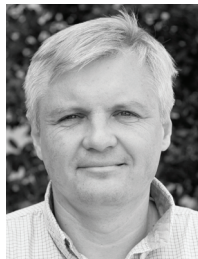
the Curriculum program.